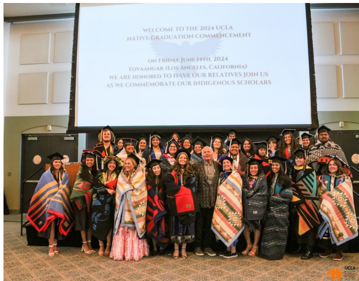
The Class of 2024 stands with keynote speaker, Gary Farmer, at the UCLA Native Graduation.