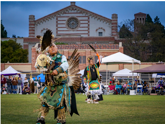
Dancers at the UCLA Annual Pow Wow.