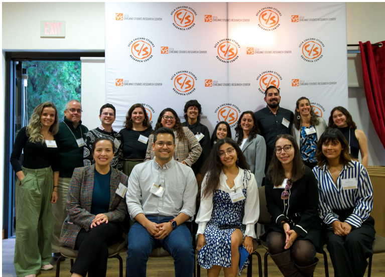
New UCLA faculty and postdoctoral scholars at the HSI Faculty Welcome on October 2, 2023.