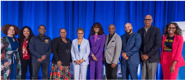
Pictured: State of Black California on April 13, 2024, at the UCLA Luskin Conference Center.