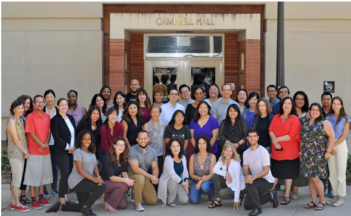
Institute of American Cultures Staff Photo 2019-2020