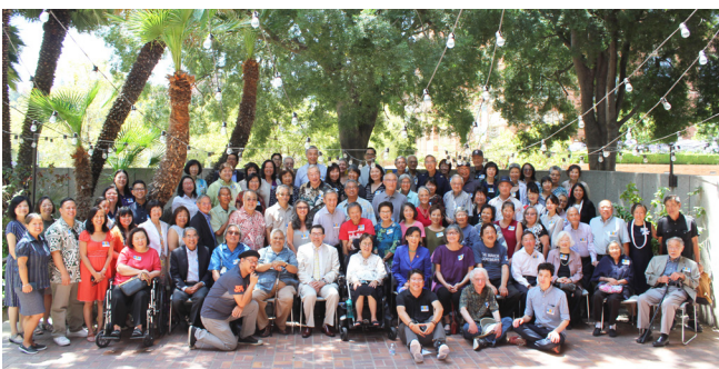
At the AASC Founders Reunion in July 2019, with alumni and friends of those who helped establish the Center, as well as current staff.