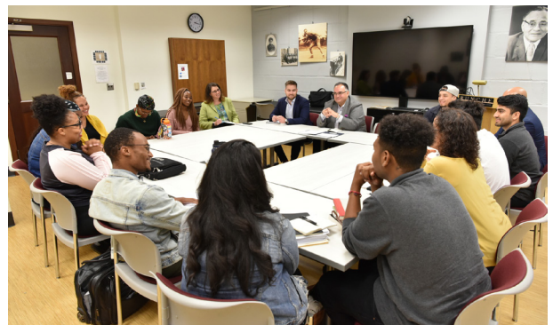
Bunche affiliated students meeting with UC Regent Perez at the Black Forum on May 8, 2019.