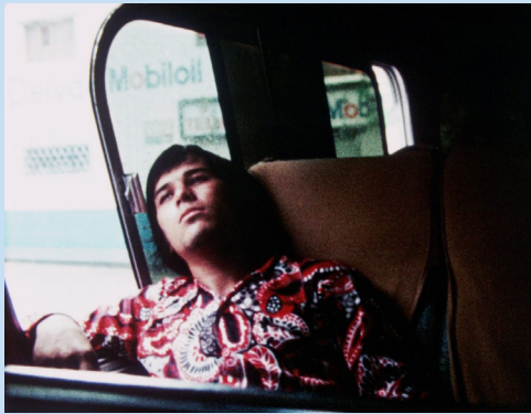
The Unwanted , 1975

For more information: https://cinema.ucla.edu/events/the-unwanted-2026-05-31/