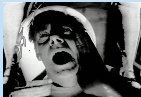
It's Coming Up, 1997

For more information: https://cinema.ucla.edu/events/computer-laser-videos-raphael-montanez-ortiz-2026-05-30/